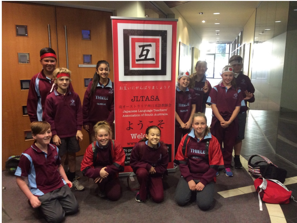
Japanese Cultural Day @ Burnside Library